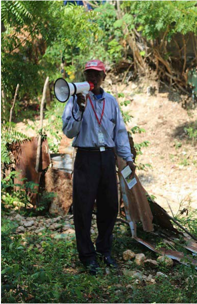
A community coordinator in Haiti helps to advertise an upcoming vaccination event

GARC is proud to announce the launch of its third online course on the GARC Education Platform - the Community Coordinator for Rabies Certificate (CCC).