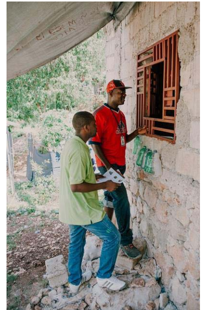
Community coordinators can help advise on rabies control issues