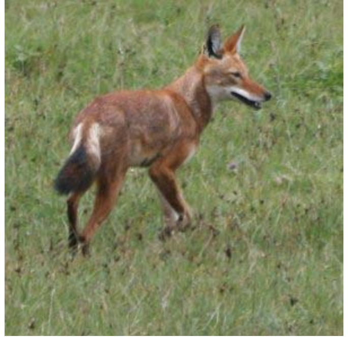
Ethiopian wolf