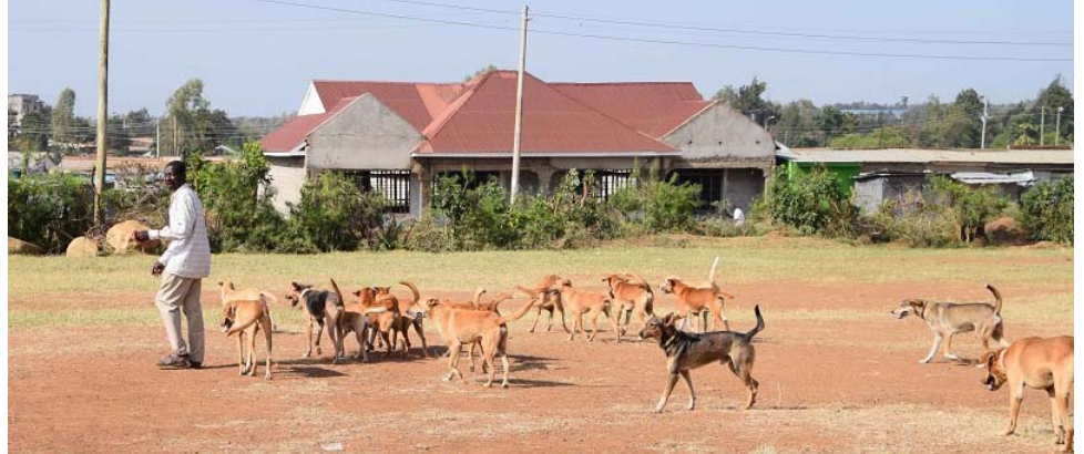
A man in Siaya who brought his 48 dogs for rabies vaccination

Last year, World Animal Protection partnered with Makueni County Government to start implementation of two of the main pillars of the rabies elimination strategy for Kenya: 1) mass dog vaccination reaching 70% of the dog population and 2) rabies awareness campaigns in schools. In response, the Makueni government matches dollar for dollar funding from World Animal Protection and in addition has committed its own funds to provide free post-exposure prophylaxis for all dog-bite victims reporting to county health facilities.