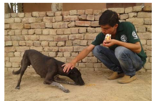
HSI staff approach a dog in the street