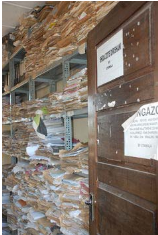
Surveillance records in a Tanzanian medical office.