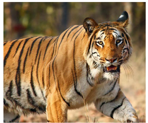
Bengal Tiger in Nagzira Wildlife Sanctuary, India