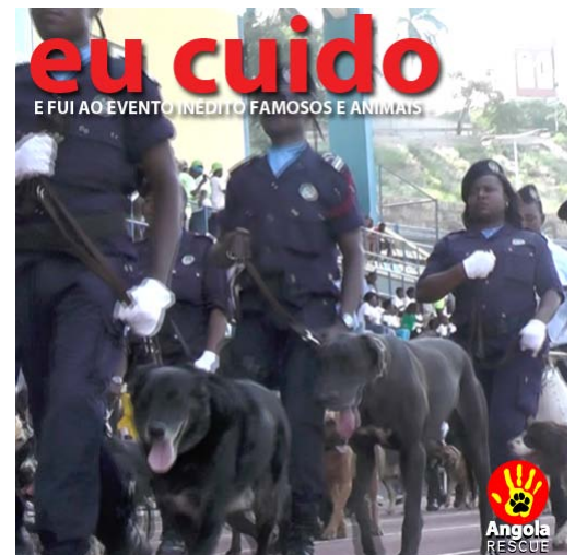
The Cavalry and Canine Training Command of Angola's national police marches with the canine brigade.

To help serve this purpose, a series of supporting documents are being prepared and distributed free of charge. These documents, some of them adapted from international institutions, such as GARC's "Want a Friend, Be a Friend" booklet and others developed by Angola Rescue, will be fundamental tools to combat and prevent rabies.