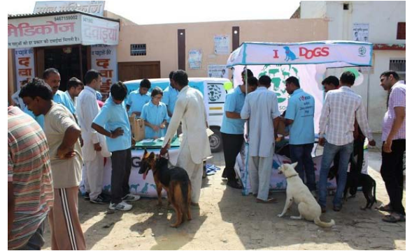
HSI staff and people waiting with their dogs for vaccination