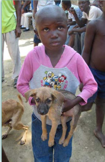
A young girl waits in line at a government run canine rabies vaccination clinic, unfortunately only held every few years due to lack of funds.

Haiti is currently one of the last countries in the Americas suffering from a significant number of human deaths from canine rabies. As part of the “last mile” of rabies eradication in Haiti, US Army veterinarians are partnering with GARC, Centers for Disease Control, Humane Society International, International Fund for Animal Welfare, Pan American Health Organization and the government of Haiti in the development of a “One Health Workshop” as a part of Continuing Promise 2015.