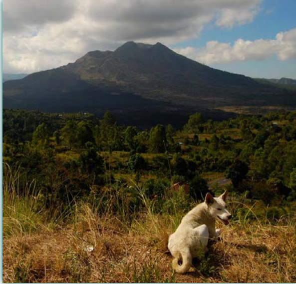
Mount Batur Volcano in Bali

Recent news reports from Bali indicate that human deaths from the rabies virus are on the rise again. Bali, an island province in Indonesia of around 4.2 million people, and a very popular tourist destination, was historically rabies-free. Cases of rabies in humans and dogs were first reported in late 2008. The site of the original infections was a peninsula on the southern coast of the island, and good surveillance coupled with a timely, effective intervention around that location would likely have prevented the epidemic that ensued.