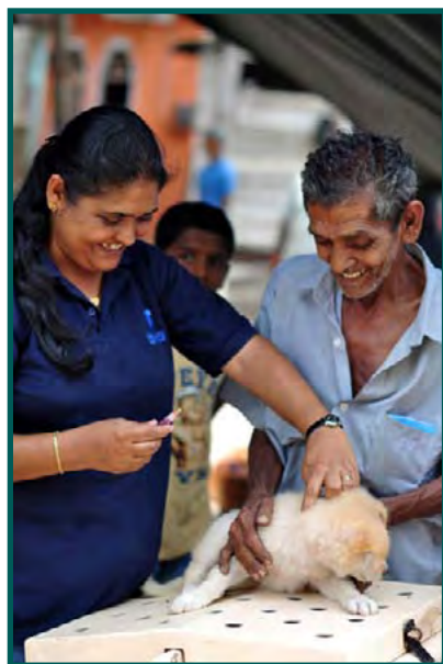
A puppy being vaccinated at a mobile clinic operated by the Blue Paw Trust in Colombo, Sri Lanka.

All leading organisations committed to controlling rabies, including the World Health Organisations, the World Organisation for Animal Health, the Pan American Health Organisation, World Society for the Protection of Animals, the Global Alliance for Rabies Control and the Food and Agriculture Organisation of the United Nations, agree that killing dogs doesn't control canine rabies and therefore has no impact on reducing the incidence of rabies in humans.