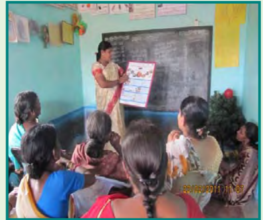
Village women are taught to be rabies educators

The number of animal bites (each a potential exposure to rabies) fell by 30% in the study villages compared to the control villages. Adopt-a-Village was developed using the principles of One Health. This worldwide strategy encourages multi-disciplinary cooperation between health care for humans, animals and the environment, for all round benefit. In the case of rabies, a zoonotic disease with devastating consequences for people and animals, this is particularly important.