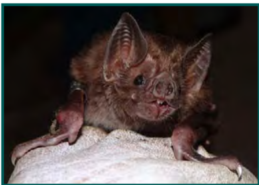
Vampire bat

Antibodies against rabies (i.e. evidence of exposure) were found in 10.2% of 1086 samples analyzed, and all well sampled colonies, even small ones, showed rabies exposures. Exposure rates were generally stable within each colony over the time period studied, with a few exceptions where local viral extinctions and reintroductions could have occurred.