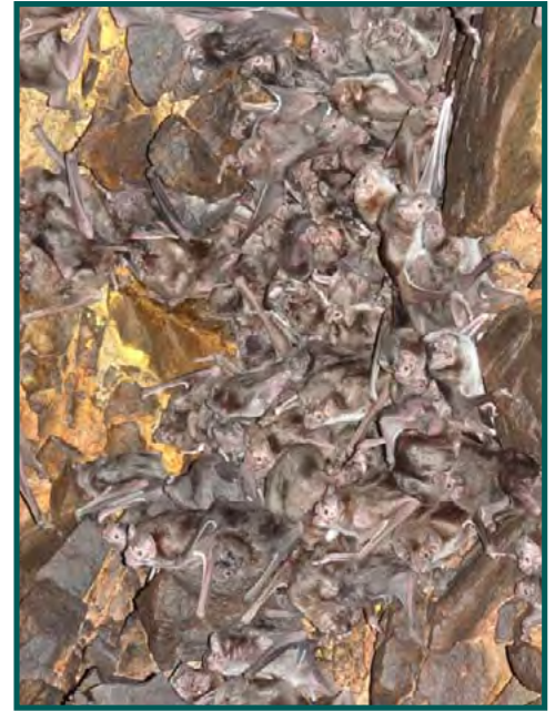
Vampire bat colony.

Mass culling of bats was started in the 1970s and relies on application of vampiricide (an anticoagulant paste), either to captured bats, or to bite wounds of cattle. Treated bats, or bats that feed on treated wounds pick up the anticoagulant, return to their colonies and the vampiricide spreads to other bats during communal grooming, killing them. As young bats tend to be dependent on their mothers for food and may groom few other adults, they are probably less affected by vampiricide. Despite widespread use of vampiricide for 40 years, vampire bat rabies still persists throughout Latin America and theoretically, culling hosts can actually increase disease prevalence through resulting increased dispersal. The effectiveness of vampiricide relies on several untested assumptions, that adult bats are responsible for rabies transmission, that rabies transmission scales with bat density and that of the benefits of culling outweigh any increased dispersal between colonies.