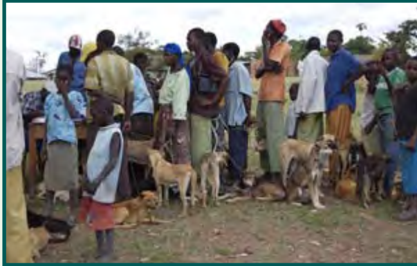
Vaccination clinic in Tanzania.

The pack also contains a fact sheet on rabies, with particular emphasis on the disease in African countries. This can be sent out with the press release, as journalists are often unfamiliar with important details about rabies and how to prevent it. The fact sheet is supported by a spreadsheet with links to articles about previous events and projects in each African country.