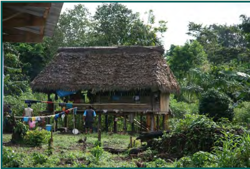
The village of Santa Marta, Peru.

Those who consented also provided blood samples which were tested for rabies Virus Neutralizing Antibodies (rVNA) by the rapid fluorescent focus inhibition test (RFFIT) technique and two types of rabies virus binding antibodies (with proven roles in the immune response to vaccination) by indirect fluorescent antibody testing (IFAT).