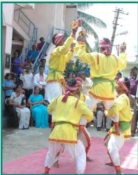
Folk dancers teach Rabies awareness