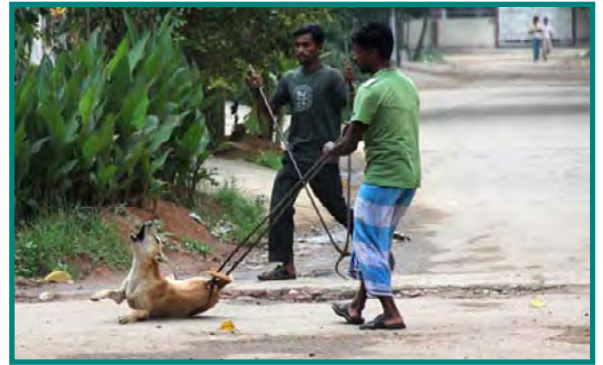
The inhumane culling of dogs is carried out all over the world in a bid to get rid of rabies.

WSPA estimates 20 million dogs are culled every year, mainly because of a fear of rabies, that's 38 dogs every minute. The only solution to control rabies in humans and dogs is the humane choice: mass dog vaccination. Vaccinating 70% of dogs in a community creates a high number of immunised dogs. Unable to spread, rabies is then eliminated in the local dog population. When canine transmitted rabies is eliminated in dogs, it is eliminated in humans.