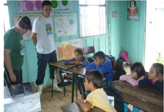
Classroom presentation about bat rabies

The program lasted five consecutive working days, and was performed by five groups each including a university faculty member, a State Secretary employee and a veterinary student. Classes were given on battery powered laptops, and included information from an educational video and a cartoon-based folder. After classes, a questionnaire was given to students and