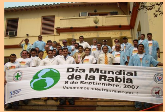
WRD Celebration in Paraguay.