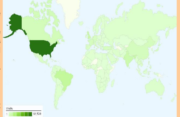
Visitors to the WRD website are worldwide (Google Analytics Map)

To date, the website has seen over 50,000 visitors with enquiries from 181 countries (see map) and continues to draw interest from those seeking general campaign information, personal stories about rabies, photos, downloadable logos (now in 28 languages) and numerous educational resources for children, pet owners, the public, teachers, and veterinarians.