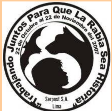
Working Together to Make Rabies History postmark, Peru, 2007

This year many new partners have joined the campaign to Make Rabies History and we are receiving reports of events being planned worldwide. For example, in Peru, a WRD commemorative stamp is expected to be released following the release