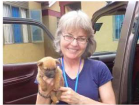
The Big Fix Uganda Uganda