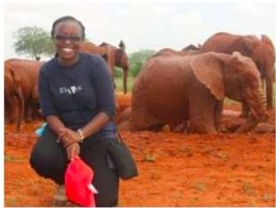
Africa Network for Animal Welfare Kenya