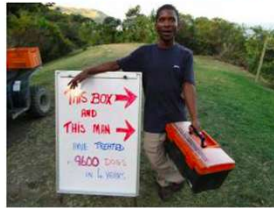
TAWI (Transkei Animal Welfare Initiative) South Africa