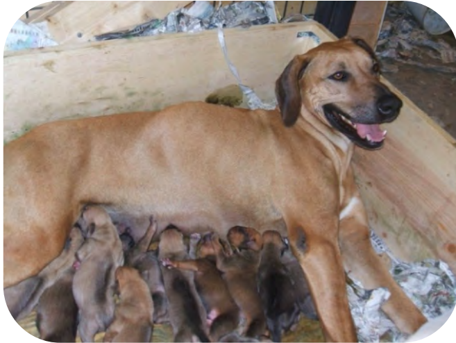
Caring for puppies